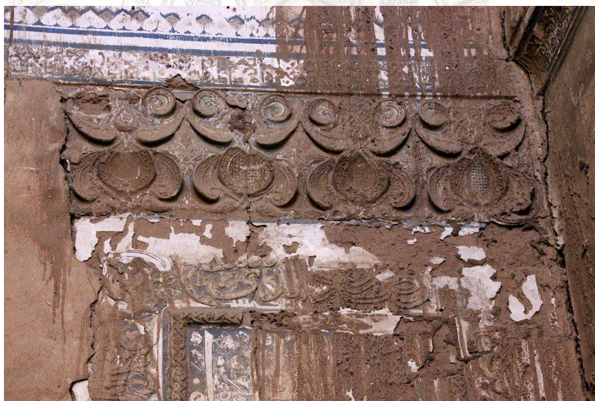
Figure 1: Shamsiyya madrasa in Yazd, Central Iran. Applied stuccos and wall paintings (c. 1365).